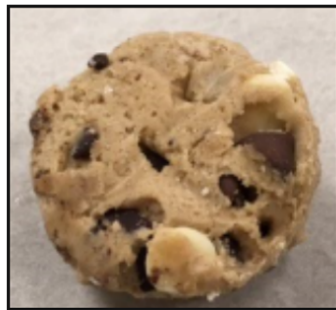
Unbaked - As Distributed

Food Name: Triple Chocolate Chip and Chunk Gourmet Frozen Cookie Dough Finished Foods: Triple Chocolate Chip and Chunk Gourmet Cookies Brand / Customer: Otis Spunkmeyer Sub Brand: Sweet Discovery